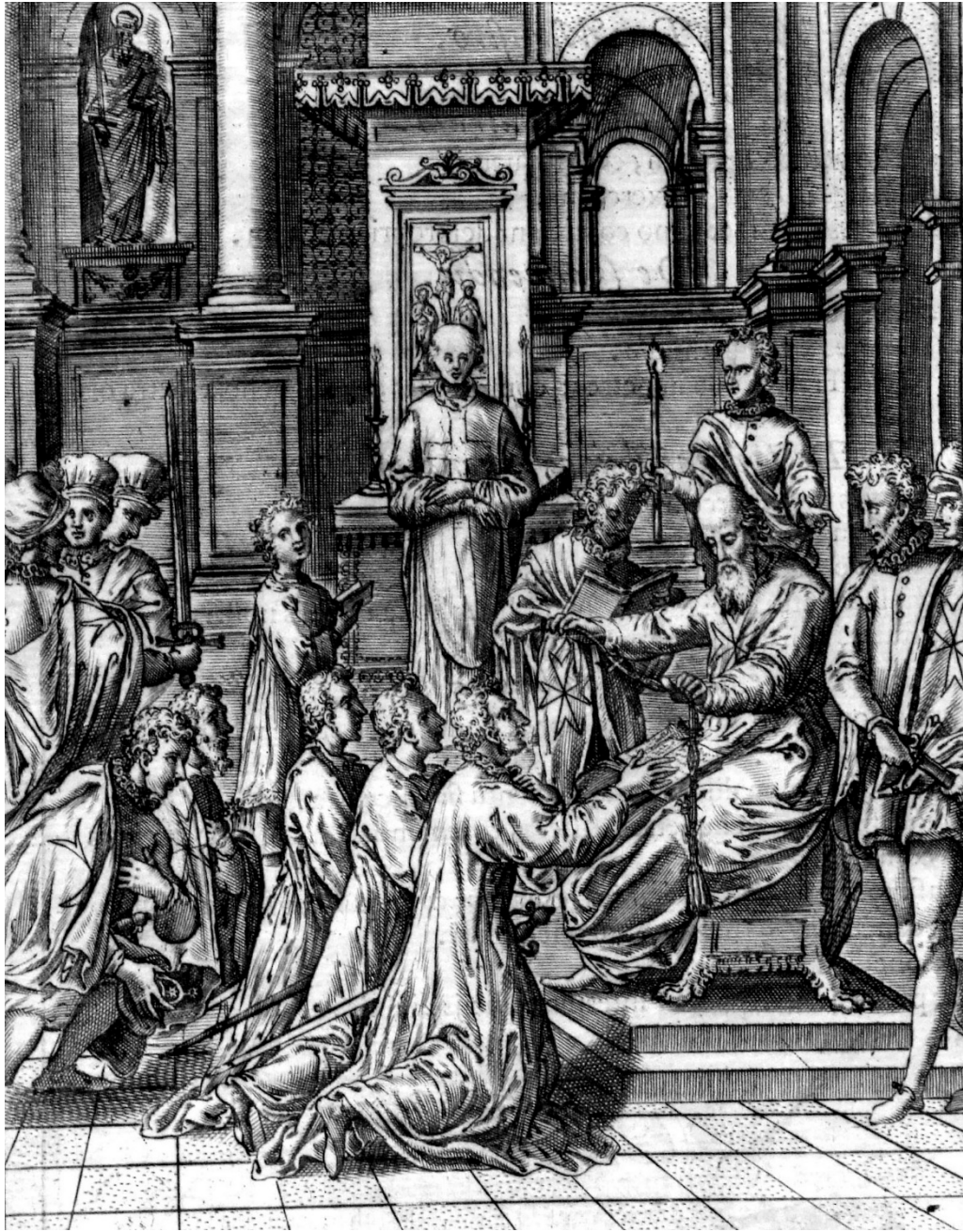
Figure 3. 'The Reception of Brothers', 1588, engraving, 18x14cm. Statuta Hospitalis Hierusalem , 4. Acknowledgement: © National Library of Malta.

On the altar in the background-centre of the image are two lit candles; even more prominent is the candle being held almost above the Grand Cross by a young boy, probably a page. The bright flame from this candle symbolised charity, the flame representing God's abundant love for all, and the will of the newly ordained Hospital-