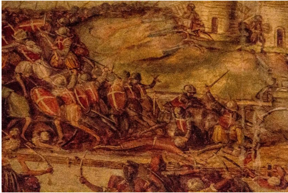
Figure 5. Detail from Matteo Perez d'Aleccio's frescoes depicting the Great Siege of 1565. Grand Master's Palace, Valletta.

The prerequisites to become a knight of the Order were strict and only allowed the elite to accede; one had to have noble lineage on both sides of the family. This guaranteed a childhood of preparation to the knightly arts, imbued with the belief that lineage gave them a natural talent for arms: « che sia atto all'esercito dell'armi ». 39 If noble enough (and rich enough) one could enter into the small group of pages living in the household of the Grand Master where the noble youth could be taught the art of war and religion by the elder knights themselves. This privilege to be a magisterial page made it possible for an individual to enter the Order before the usual novitiate entry age of fifteen. But nobility alone did not suffice. One had to be unmarried, of legitimate birth, free from debt, not branded with infamy, aged between fifteen and thirty, and free from any other religious order. It was assumed that if the applicant was endowed with all such qualities, then a background of noble education was guaranteed. This would have involved the study of the arts, etiquette and the profession of war. Furthermore, it was specified as a prerequisite that one had to be healthy in mind and body and without any impediment in his person: « Requisito della sanita del corpo, e della mente; che sia ben composto di corpo, ed atto alle fatiche ». 40