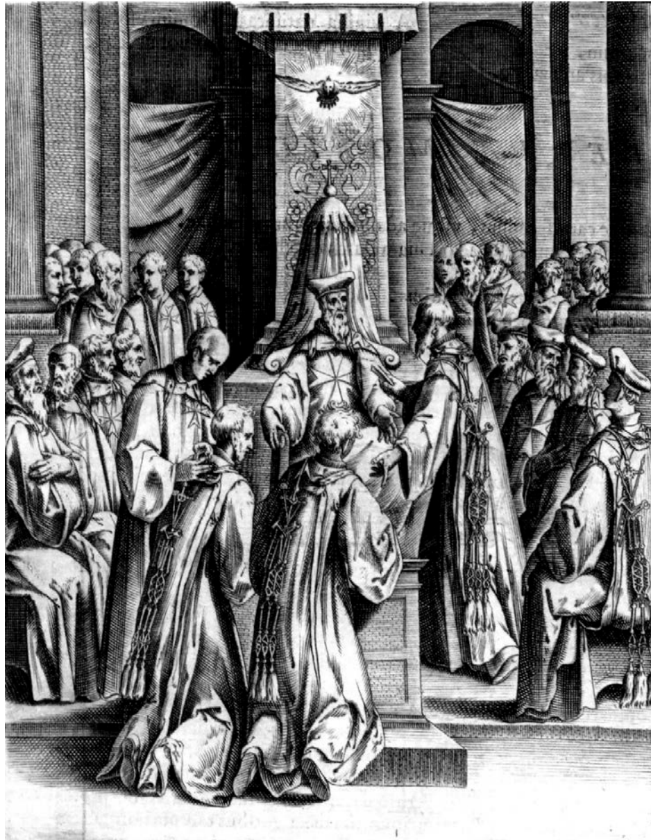
Figure 4. 'On the Expulsion of Brothers', 1588, engraving, 18x14cm. Statuta Hospitalis Hierusalem , 90.

While images such as these in the Verdalle Statuta represented an ideal vision of Hospitaller identity, including masculinity, they were rituals that Hospitallers really did experience as participants and as spectators. The ranks of the Order were about structuring distinctions between men within a male world that rarely made any reference to women; these were imbued by, and supported a hierarchical and patriarchal