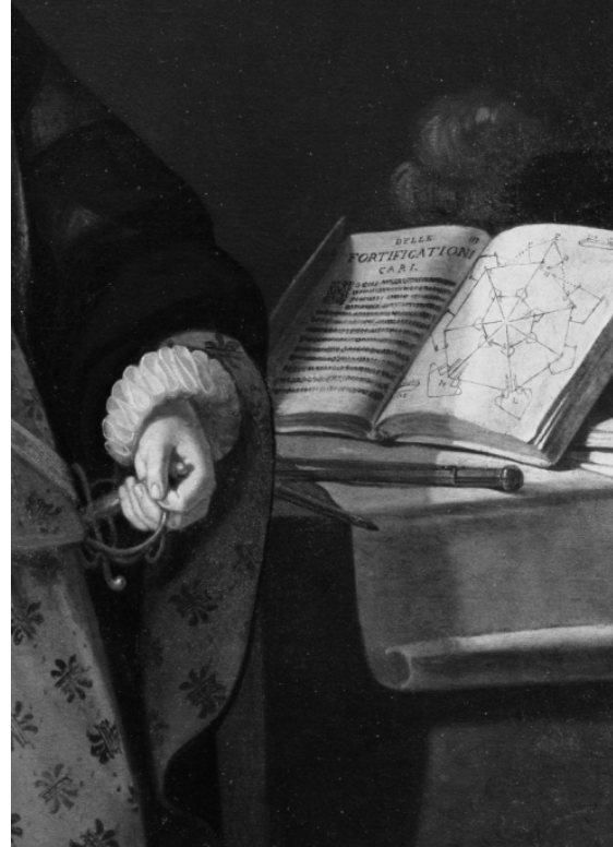
Figure 2. Detail from Figure 1 showing the hilt of Giovan Carlo de' Medici's sword, and Bonaito Lorini's Le Fortificazioni (Venice, 1609), courtesy of the Galleria degli Uffizi, Florence, inv. 1890, n. 3649.