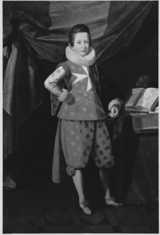
Figure 1. Giusto Suttermans and workshop, Giovan Carlo de' Medici (1622), oil on canvas, 175x117cm, courtesy of the Galleria degli Uffizi, Florence, inv. 1890, n. 3649.

This paper will seek to explore aspects of military-religious masculinity by looking at notions of Hospitaller masculinity, the function of swords in shaping Hospitaller identities, and the role of military engineers within the Order of Malta.