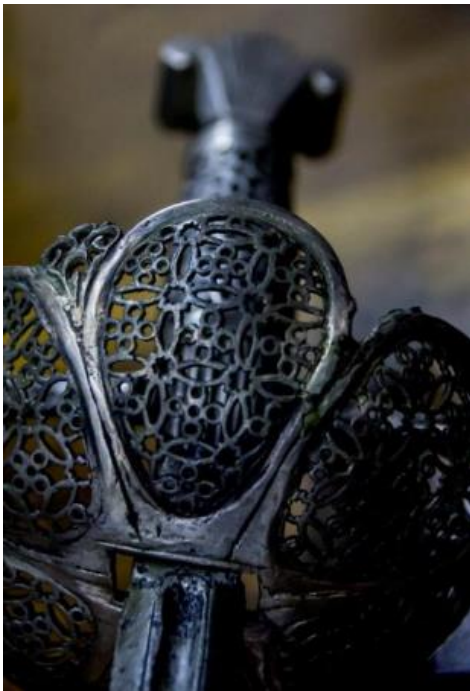
Figure 6. The beautifully crafted silver hilt of the rapier of Grand Master Martin de Redin (r.1657-1660) (Mdina Cathedral Museum).