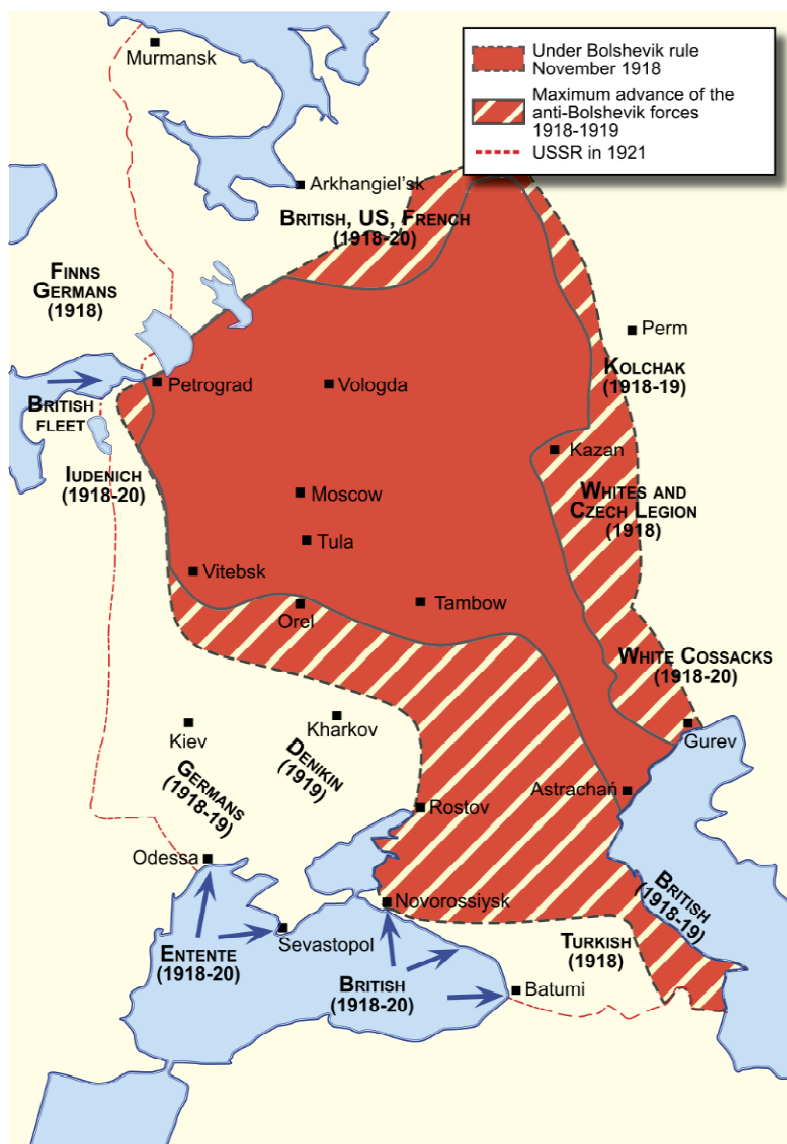
Fig. 3. The Russian civil war

My claim is twofold. First, these internecine conflicts were exercises in butchery and pillage under conditions of hunger bleeding into famine. And secondly, the civil war was deformed by the presence, albeit in relatively small numbers, of Western troops who initially took Bolshevik Russia's withdrawal from the conflict as treachery, and who were determined to reassert Western interests in Russia by the overthrow of the Bolshevik regime itself. Their failure and that of their many allies in the White armies to do so was as decisive in ending the second Great War as the Bolshevik revolution was in ending the first Great War in 1917.