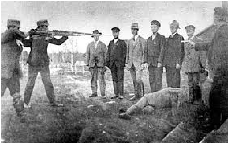
Fig. 2. Executions of “reds” during the Finnish civil war

supported by the new Bolshevik regime. Against them conservative forces were backed by the German army, whose military detachments were in Finland. Battles for Tampere and Helsinki were won by the White Guard and German forces. Plans to establish a German-backed monarchy in Finland were dashed only by the November defeat of Germany.