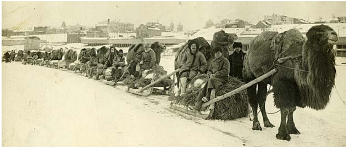
Fig. 4. Camel convoy on the frozen Volga in Tsaritsyn

In 1921, famine of potentially catastrophic proportions impelled the Bolshevik government to work with the Hoover Food Aid program. It worked because Hoover realized that while agricultural production was crippled by war and civil war, the real problem of avoiding famine was the need to provide transportation through a chaotic and strife-torn rural landscape. That he did, using his expertise as a civil engineer with knowledge of the Russian terrain. He was not alone. There were many other European and local agents who made a difference. Together, they were able to save the lives of a generation of children in Russia, Ukraine and Byelorussia (Fig. 4)